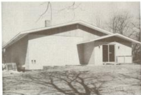
Our New Home on Montauk Highway in Westhampton First Meeting Held January 3, 1968