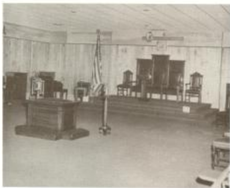
OUR NEW MEETING ROOMS