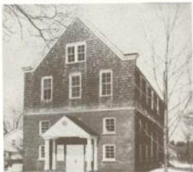
Mechanics Hall in Westhampton Beach Our "Home" for 43 Years